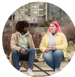
EDGE conversation guide