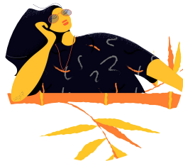
Principled Innovation™ Card Decks