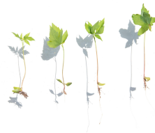
Principled Innovation™ Framework