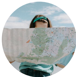
Start here roadmap