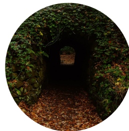
Scent of Character videos