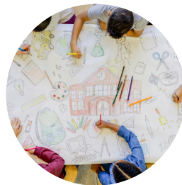
"Building a Foundation for Principled Innovation" course