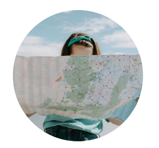
Start here roadmap