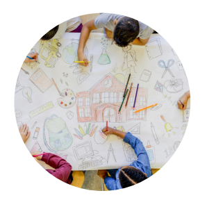
"Building a Foundation for Principled Innovation " course