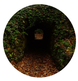
Scent of Character videos